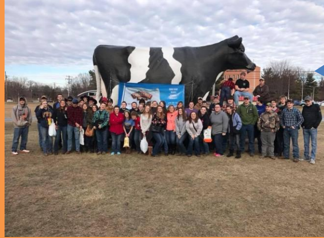
2020 PA Farm Show